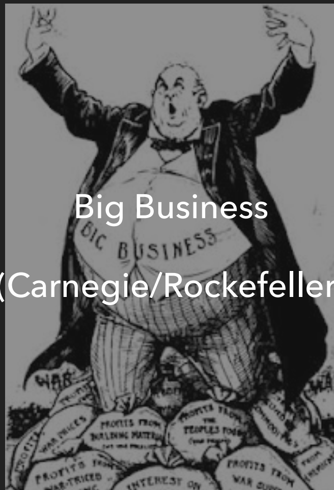
Big Business (Carnegie/Rockefeller)